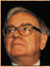
The Man with the Midas Touch Mr Warren Buffet

Chairman and Chief Executive Officer Berkshire Hathaway Holdings