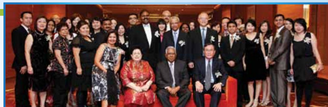
AIR Team with the President of Singapore in January 2011 to mark our 20th anniversary of serving the insurance industry as the Voice of Asia

With 20 years under its belt, Asia Insurance Review , hailed by market leaders as THE leading premier professional regional journal, now enters its 21st year as a strategic partner to the insurance industry. It is continually committed to serving the insurance industry with information, technical and editorial content, as well as daily on-the-spot updates, high quality technical conferences, reinsurance rendezvous, and industry Awards hand-in-hand to support the industry's march towards higher standards and greater professionalism.