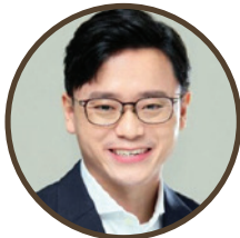
Photo Finish: Seeing Is Believing