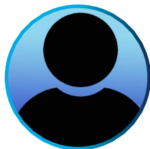
Senior Representative, Deloitte

9:45 am The Future CFO: Mastering the Art of Navigating the Complexity and Dynamics of the Insurance Industry (Topic to be confirmed)