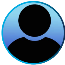
Senior Representative, Deloitte

9:45 am The Future CFO: Mastering the Art of Navigating the Complexity and Dynamics of the Insurance Industry (Topic to be confirmed)